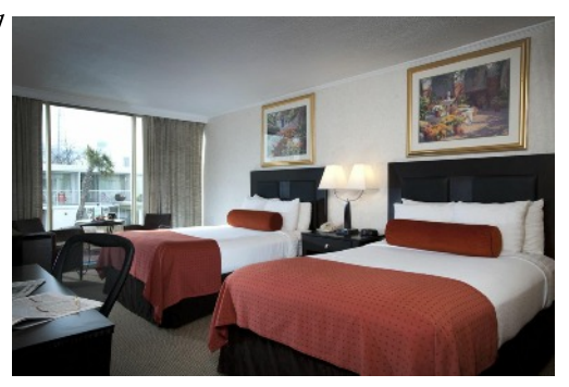
Two Doubles Room at el Tropicano Riverwalk Hotel

LOCAL TRANSPORTATION – A trolley runs every 15-20 minutes with a stop just a block from the hotel, making all of downtown easily accessible. A Double Decker Bus stops in front of the hotel every 20 minutes for a "hop-on, hop-off" tour of San Antonio.