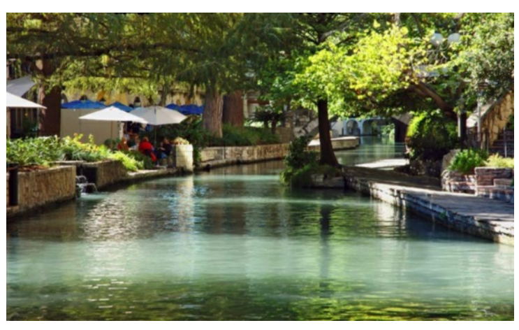
Take a Boat Tour or Stroll along San Antonio's River Walk

Delta's success at finding Brothers-in-Arms makes its reunion the place to be. 72 veterans gathered in Tucson in 2017, and we want to exceed that at San Antonio in 2018. Regiment and Division reunions have never attracted that many Delta Vietnam Veterans. Not even close, so San Antonio is where you're most likely to see those you served with. Don't put it off. We know you're sure you'll make it to "next year," but for many (see "Fiddler's Green") there won't be a "next year."